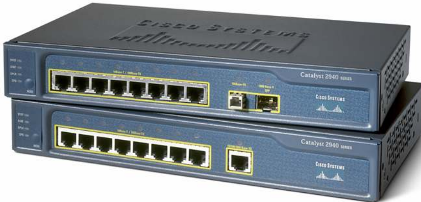
Figure 1. Cisco Catalyst 2940 Series Switches

The Cisco Catalyst 2940 Series is extremely easy to set up and configure via Cisco Express Setup, a simple Web-Based setup utility. For more advanced configuration and ongoing management, the Cisco Catalyst 2940 Series has a console port and supports remote management protocols such as Telnet, Simple Network Management Protocol (SNMP), as well as Cisco Network Assistant, which is a free PC-based network management application. Combine this with the rich functionality of Cisco IOS® Software, and these switches provide comprehensive functionality and manageability for classrooms, conference rooms, or other very small workgroup environments. In addition, the Cisco Catalyst 2940 Series is supported by a limited lifetime warranty. The Cisco Catalyst 2940 Series switches provide the lowest total cost of ownership in their product class with their durable design, enhanced security, simple installation and management, and award-winning Cisco support.